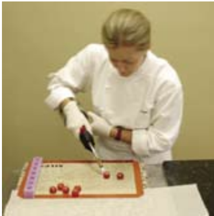
10. Clear the spheres with a torch: Whenever casting sugar into a silicone mold, micro-bubbles will appear on the surface. To bring out the depth of color in the casting, the spheres must be 'cleared' with a torch. This removes the surface bubbles and creates a glossy shine on the surface.