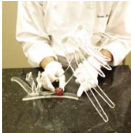
11. Attach the sphere: When choosing a place to add color, select an area where you want the viewer's eye to focus. Resist the temptation of filling up empty areas. Sometimes, less is more. (See photograph 27 for a close up of the sphere.)