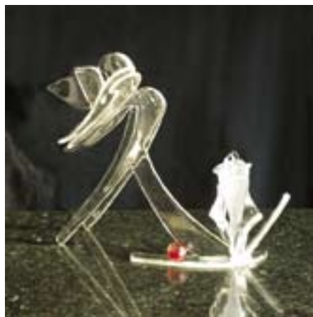
14. Final composition: Chef Notter has created an elegant composition with a good balance between hand blown and molded elements.

“The addition of pulled and blown decorative elements is a choice for each chef to make. Even without these finishing touches, the centerpieces are eye catching and beautiful in their simplicity.” - Susan Notter