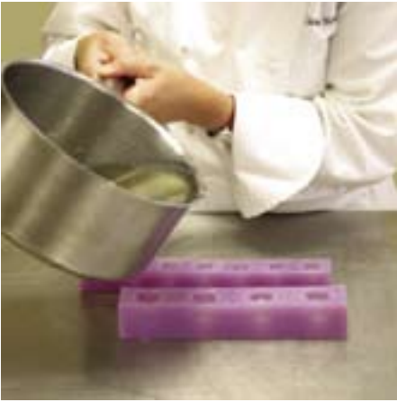
7. Casting multicolored spheres: To add a splash of color to the centerpiece, Chef Notter casts sugar spheres. She makes a multicolored sphere by filling the pop-up mold half-way with clear Isomalt.