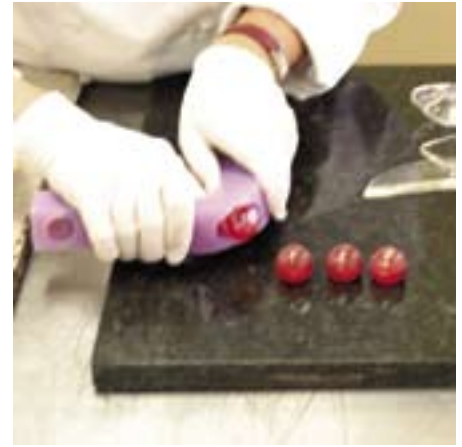
9. Allow to cool and then unmold: In about 45 minutes the spheres can be unmolded. The silicone mold is flexible enough to pop the spheres out without tearing.