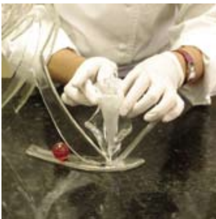
13. Attach the flower: From start to finish, this centerpiece took less than 15 minutes to assemble.