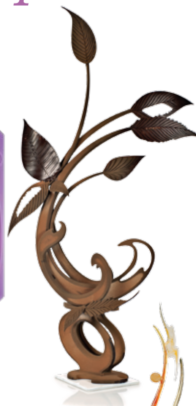
Flames ShowStopper SS02