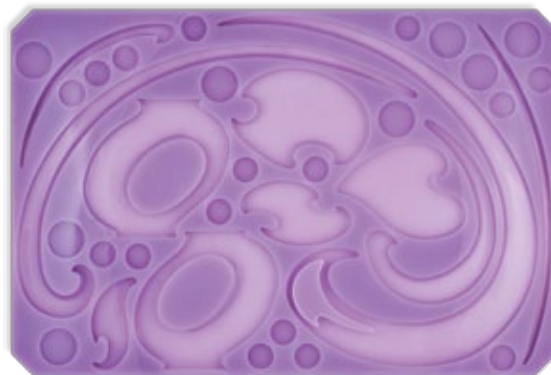
Waves ShowStopper SS01

With the new ShowStoppers, your pieces will cause heads to turn, and coworkers to marvel.