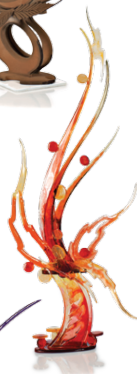
Herons ShowStopper SS03